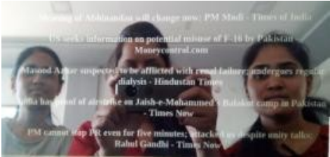
Fig 1.6: Google Headlines