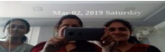
Fig 1.4: Date and Day window