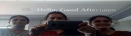
Fig 1.3: Welcome window