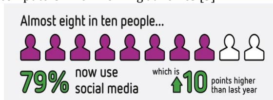
Figure 1: Total number of social networks users

Usually, users commit numerous risks and errors when utilizing social networks services, for example, utilizing unapproved programs, misuse of corporate PCs, unapproved physical and network access, misuse of passwords and exchange touchy data between their work and computers when working at homes [3].